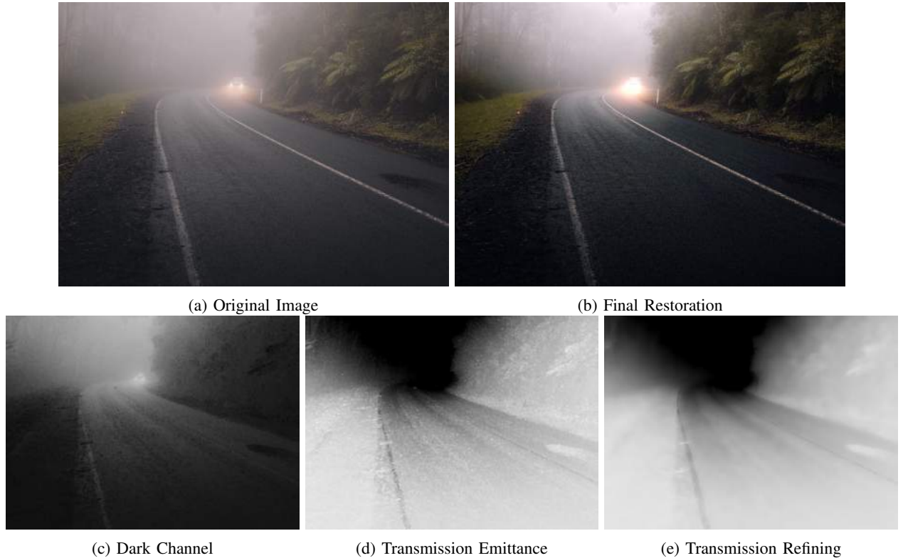
Fig. 2: Results: Asphalt Road Covered in Fog [14]

The next crucial step is to estimate the Transmission, a pivotal parameter in haze removal. Drawing on the dark channel