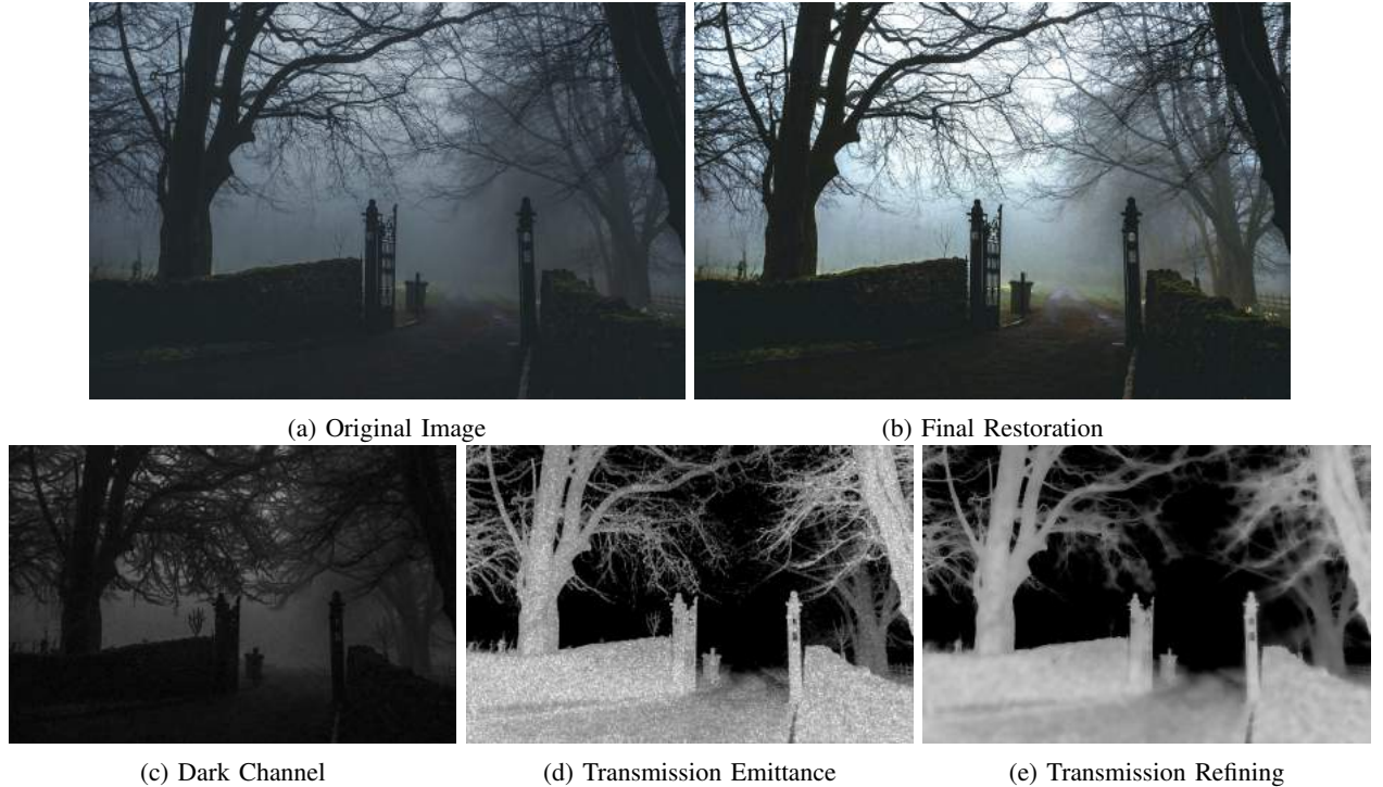
Fig. 4: Results: Fog in City [17]

While the algorithm demonstrates remarkable capabilities, it's important to acknowledge its potential limitations. Scenarios where scene objects mimic atmospheric light and cast no shadow might challenge the algorithm's assumptions. Nonetheless, its performance across a diverse image set underscores its usefulness. Visual transformations from 'before' to